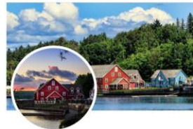
King's Wharf Theatre

The PROBUS Club of Alliston will be attending GREASE